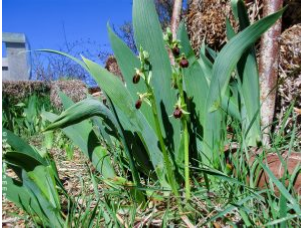
Ophrys sphegodes is one of the most unpredictable orchids on the terrain, appearing on different spots every year. It's also the earliest one to flower and distinguishable by the yellow-green sepals. 4 April 2010.