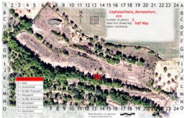
Cephalanthera damasonium was first detected in 2018.

Below are shown, in alphabetical order, the distribution maps of the other orchid species present on the terrain. For the Epipactis species I have no reliable data yet, as it's not very clear if it's just one species ( Epipactis helleborine ) or several (sub-)species, but every year there appear about a dozen of them spread over the terrain, especially on the borders of woodland and grassland.