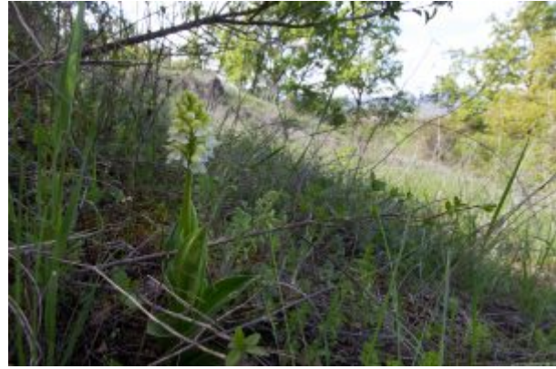
The flowers of Orchis purpurea can vary their colours considerably but this completely white specimen ('variant albiflora ') seems to be quite rare, according to Peter Zschunke on his website . 2 May 2018 17:20