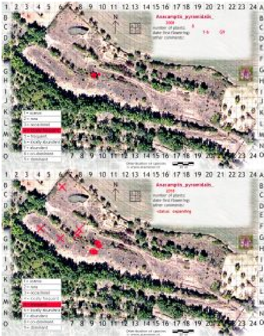
The distribution maps of Anacamptis pyramidalis of resp. 2008 and 2018. The spectacular increase in 2018 is probably partly due to the exceptionally wet spring.

Almost all of the present orchid species seem to prefer the transition zone between wood and grassland. The fact that my terrain is rich in this kind of border niches may partly account for so many orchids. Related to this border effect is their tendency towards human culture, that is they prefer semi-natural situations where humans have a low but decisive impact on nature: mowing grass, pruning or cutting trees, moving soil.