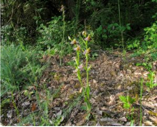
Ophrys apifera . 10 June 2007.