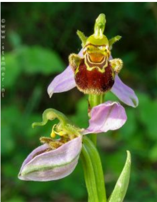
Ophrys apifera . 10 June 2007