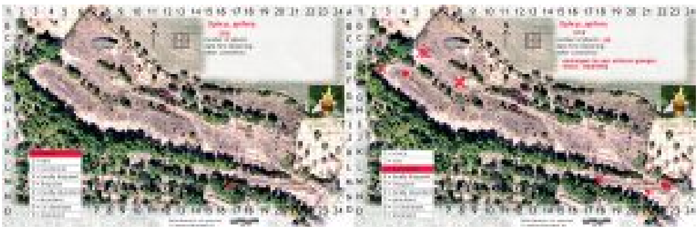
Changes in the presence of Ophrys apifera over a 10 year period.